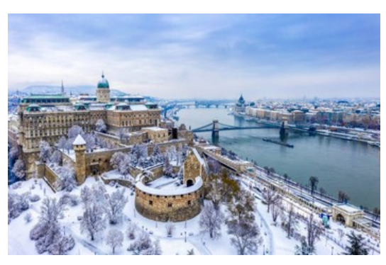
Winter fun in Budapest

ELTE offers Hungarian language and culture courses for their students.